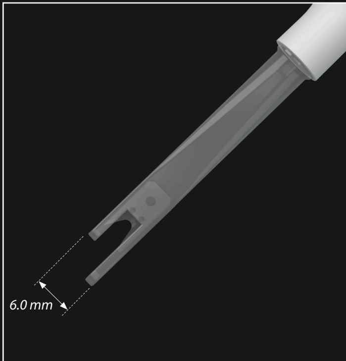
Fig.: Insulated cutting blade by the atraumatic tip of the Carpolux.

Carpolux's built-in lighting system provides better visualization of the treated regional lowering safe and effective technique, reducing the surgical time and soft tissue morbidity.